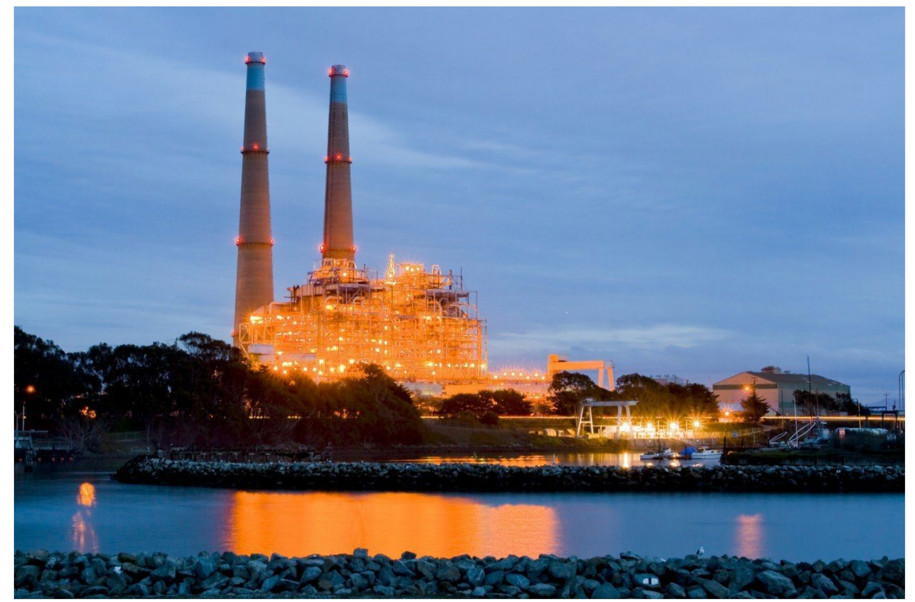
The Moss Landing Power Plant could soon be the site of the world's largest lithium-ion battery project. Photo from Hugo | FLickr.

A pair of 500-foot smokestacks rise from a natural-gas power plant on the harbor of Moss Landing, California, casting an industrial pall over the pretty seaside town.