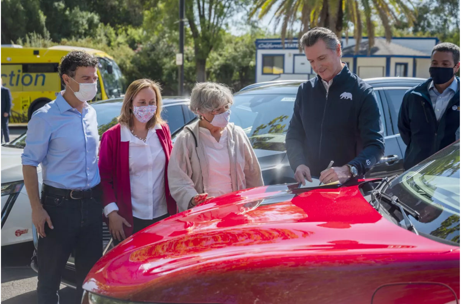
Gov. Gavin Newsom signs an executive order — on the hood of an electric vehicle — requiring all new passenger vehicles sold in California to be zero-emission by 2035.

“Some would say it’s the righteous and right climate decision,” Newsom told The Times’ editorial board earlier this year.