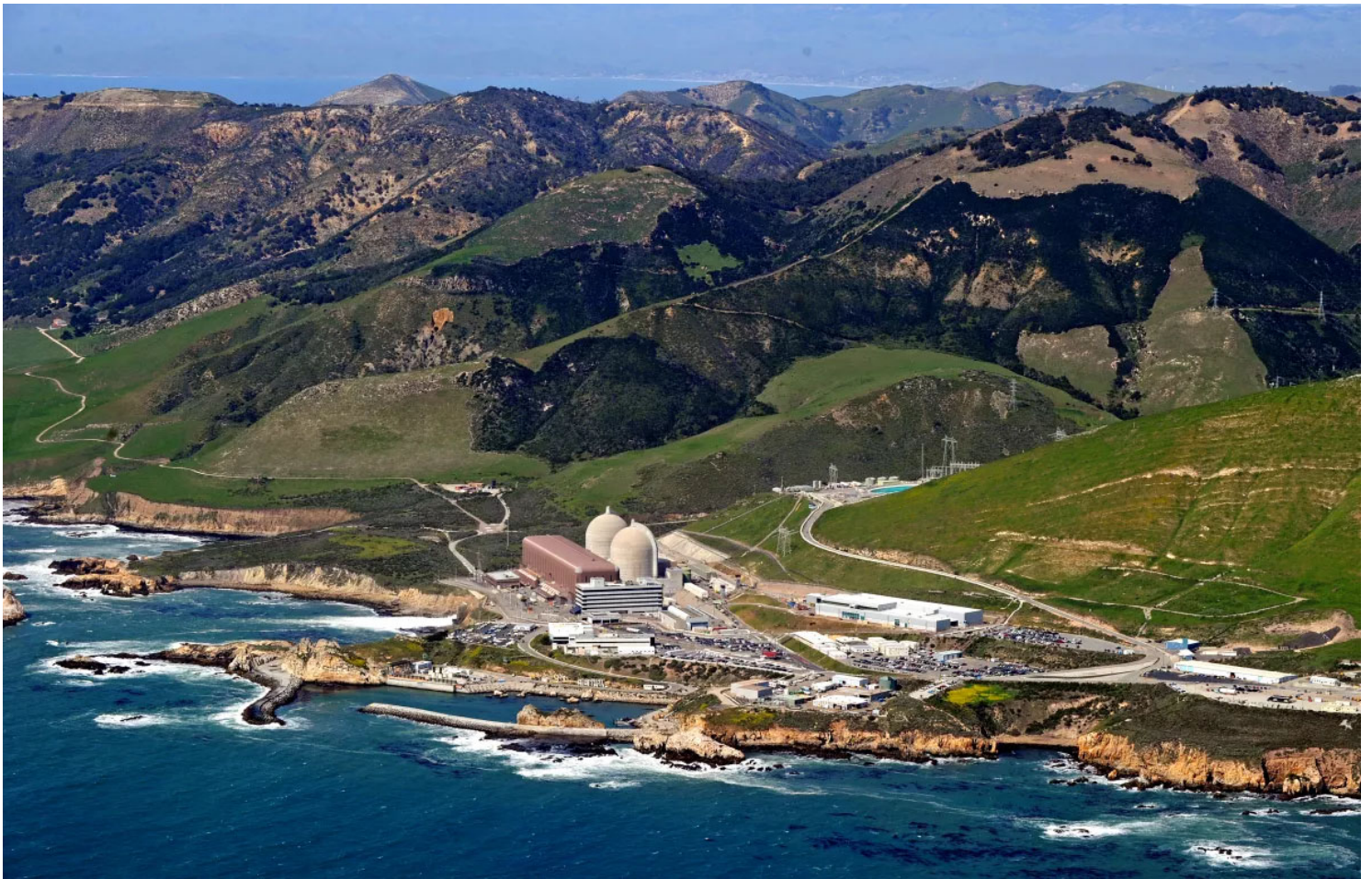
An aerial view of the Diablo Canyon nuclear power plant in San Luis Obispo County.