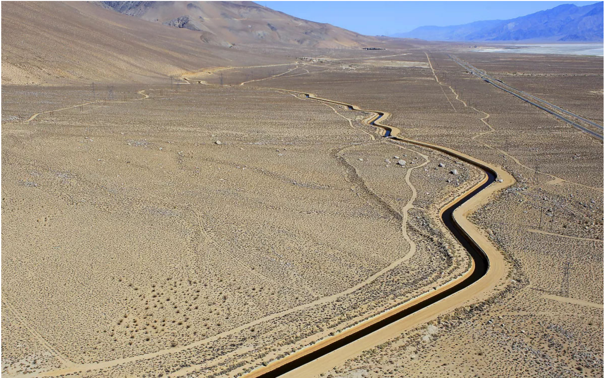
An aerial view of the Los Angeles Aqueduct as it flows south in its concrete-lined channel from the Owens Valley.