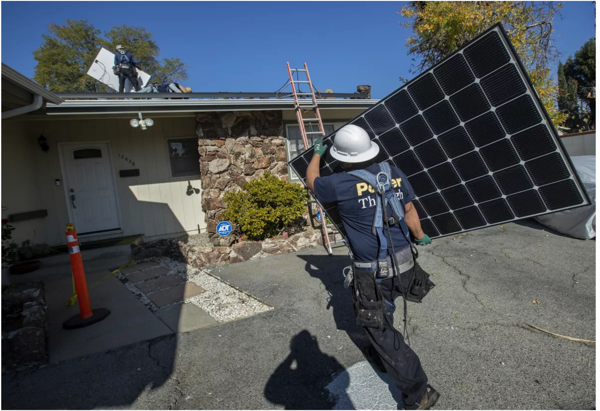
Sunrun employees install rooftop solar panels at a home in Granada Hills in 2020.