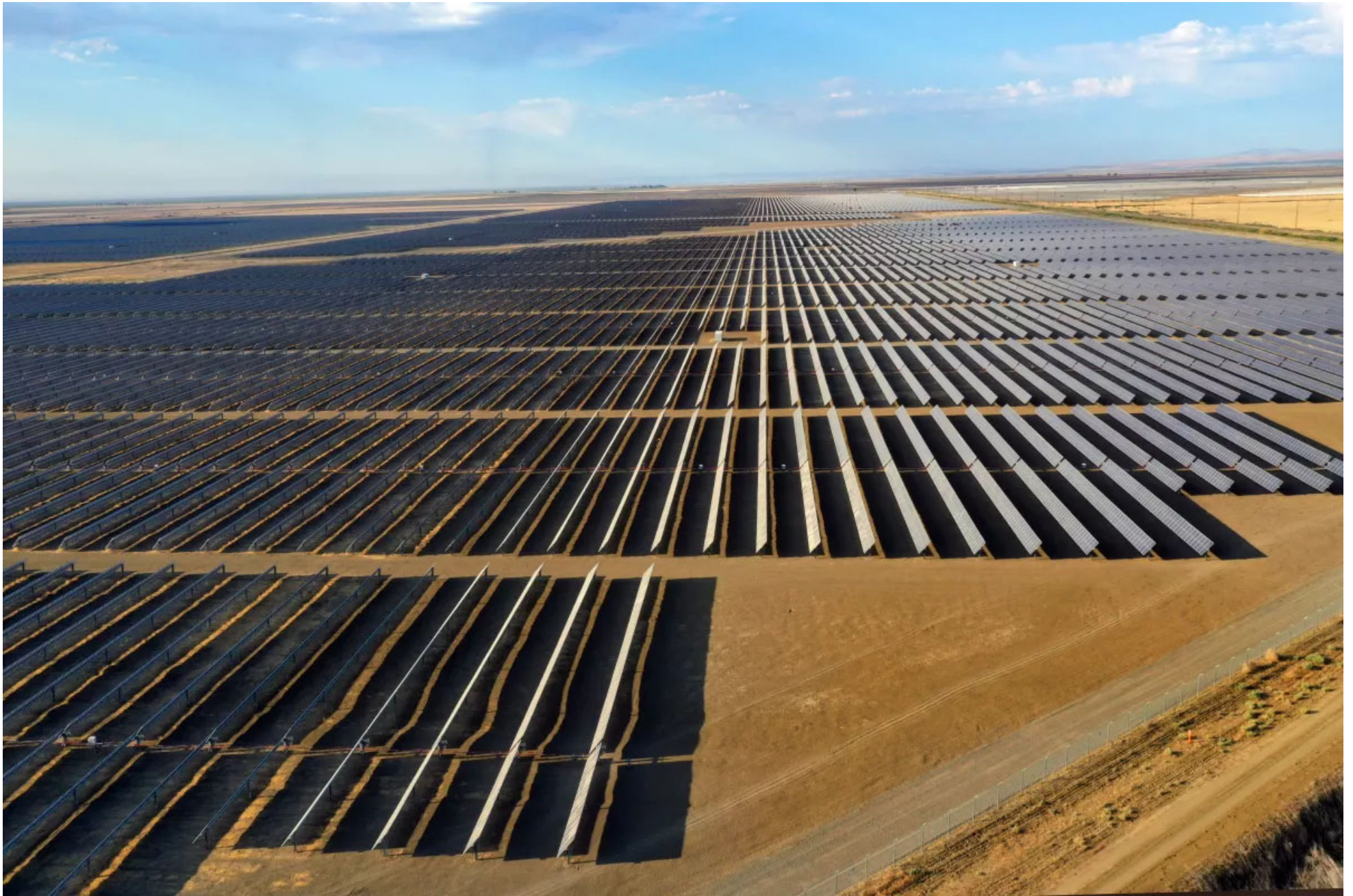
Westlands Solar Park in the San Joaquin Valley could become one of the world's largest solar farms, if additional phases are built.