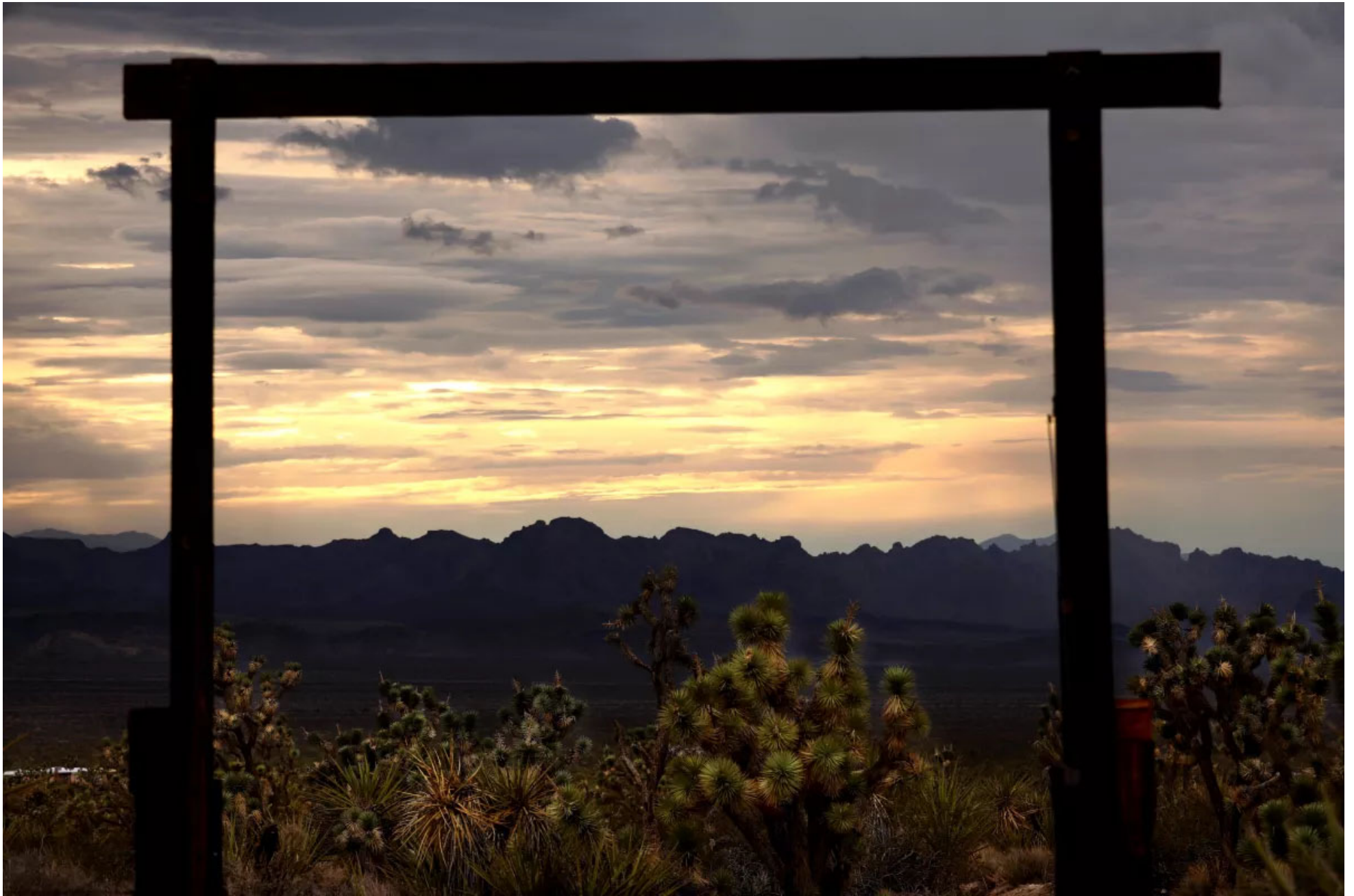
The gateway to the Mystery Ranch, which hosts artists and scientists who visit the Avi Kwa Ame area.