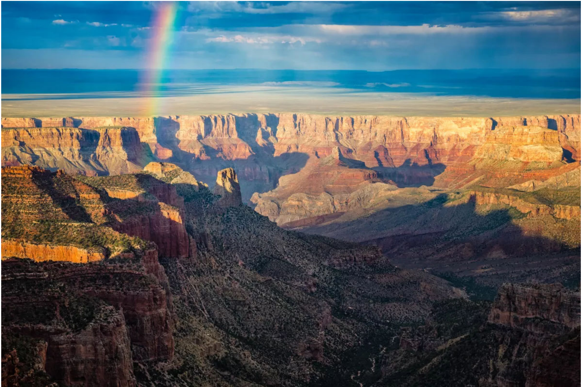
A rainbow over the Grand Canyon, as seen from Roosevelt Point on the North Rim.

Let's end with two pieces of cool public lands news.