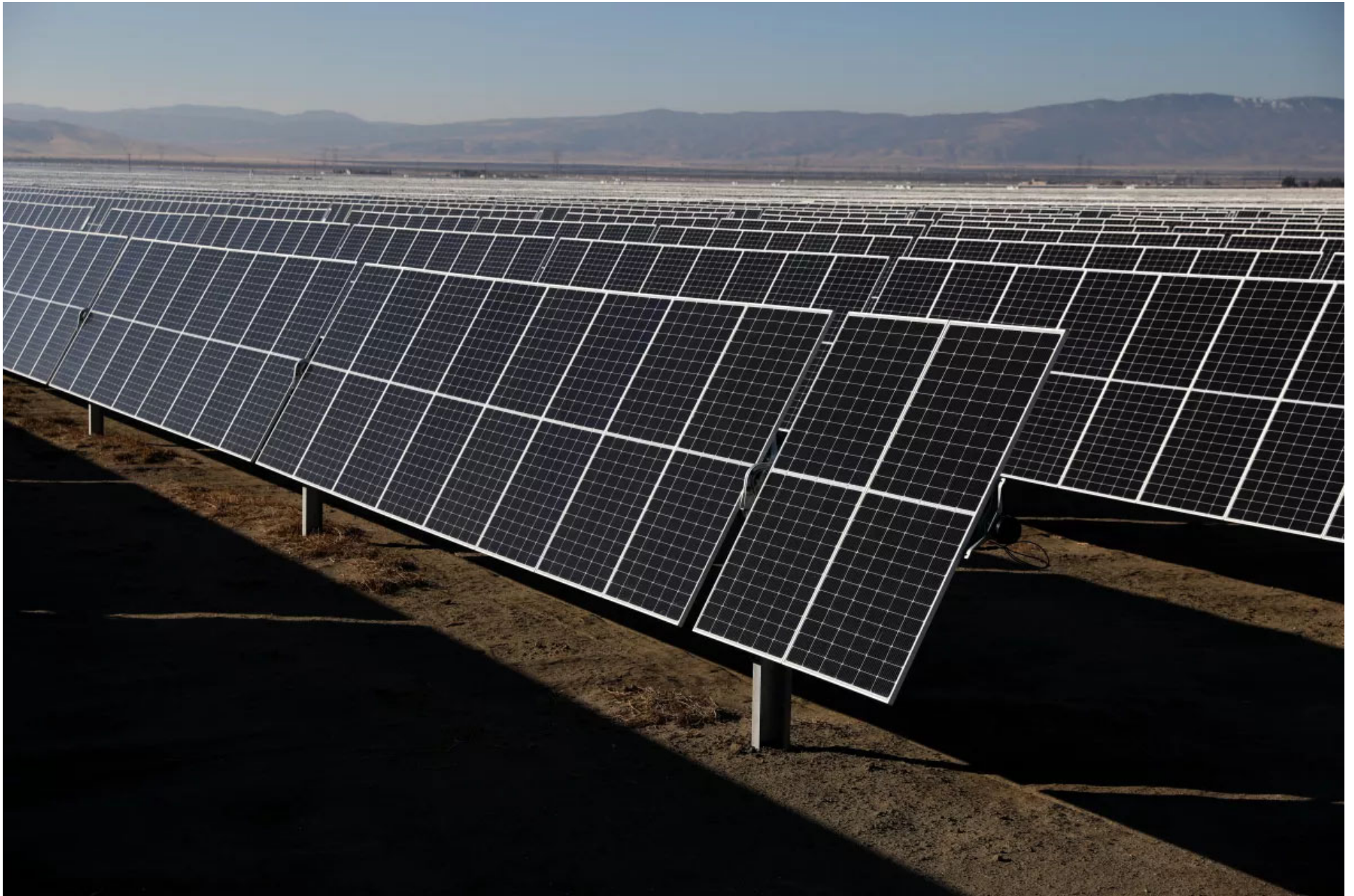
The 192-megawatt Rosamond Central solar farm in Kern County, seen in 2021.