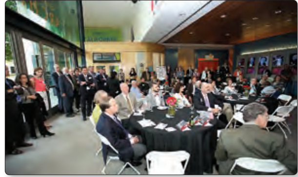
Attendees at the 2015 Clean Power Champions Awards Ceremony