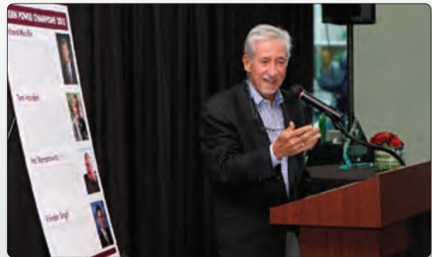
Tom Hayden, former State Senator, legendary activist, and leading clean-energy advocate