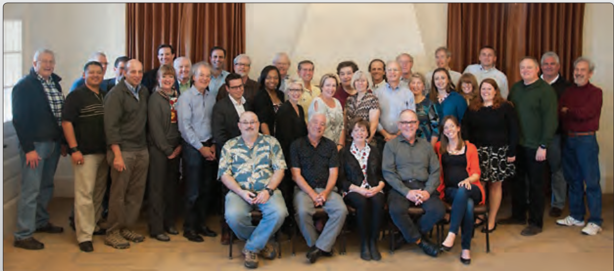
CEERT Board members, affiliate representatives, and staff