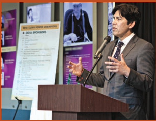
Kevin de León, California State Senate President Pro Tempore