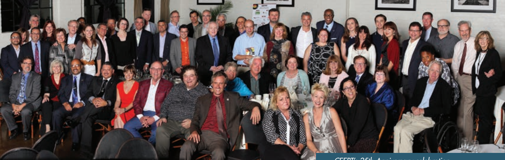
CEERT's 25th Anniversary celebration