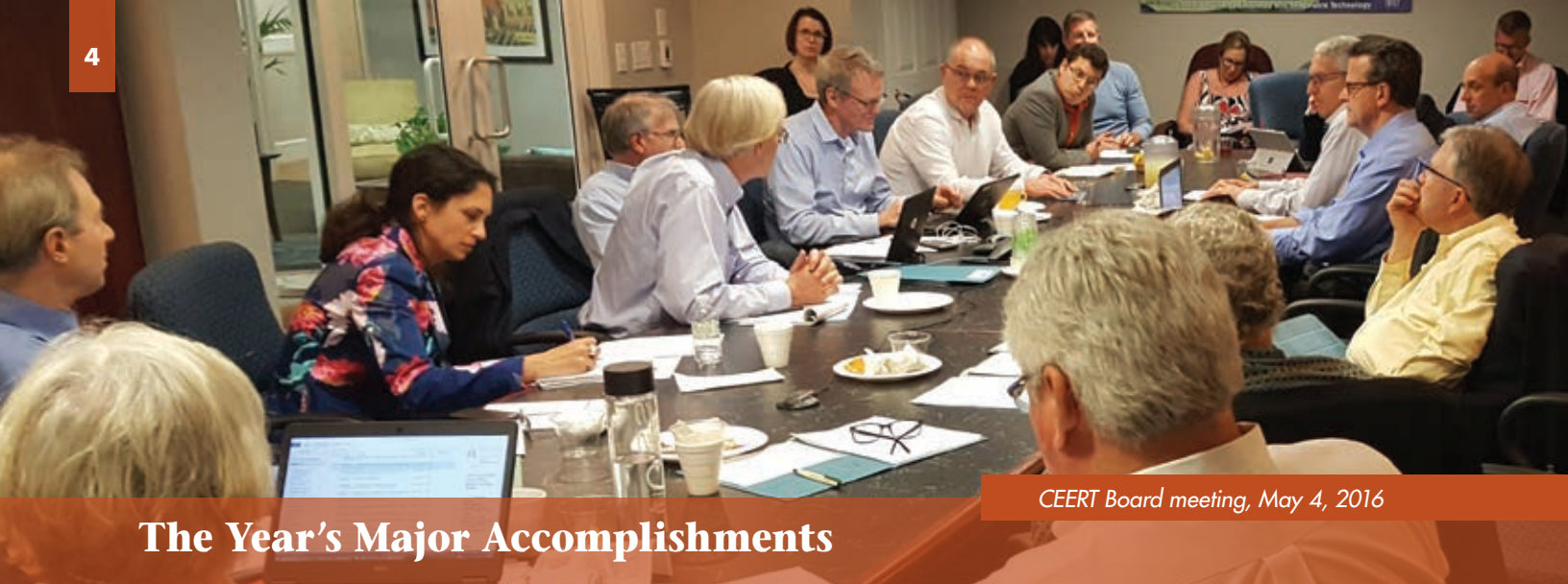
CEERT Board meeting, May 4, 2016