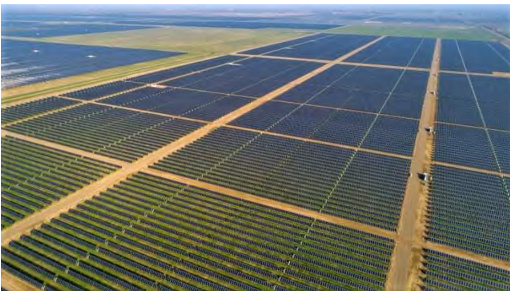
Westlands Solar Park, in the Central Valley near Fresno