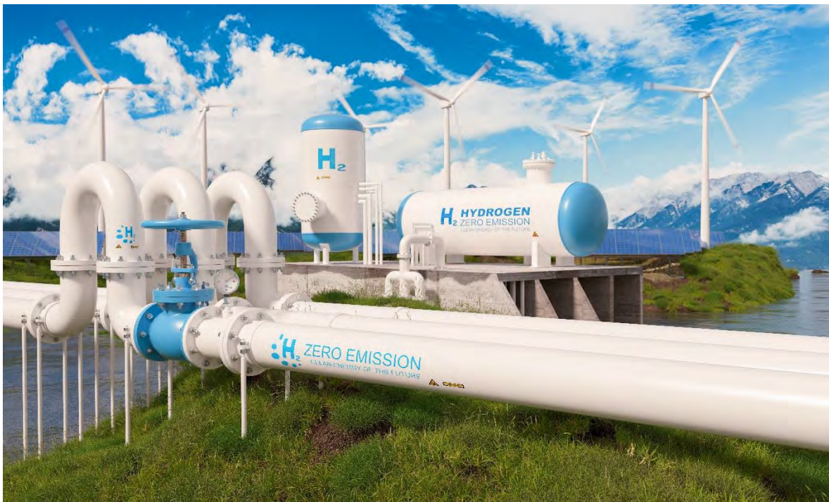
A hydrogen energy storage system