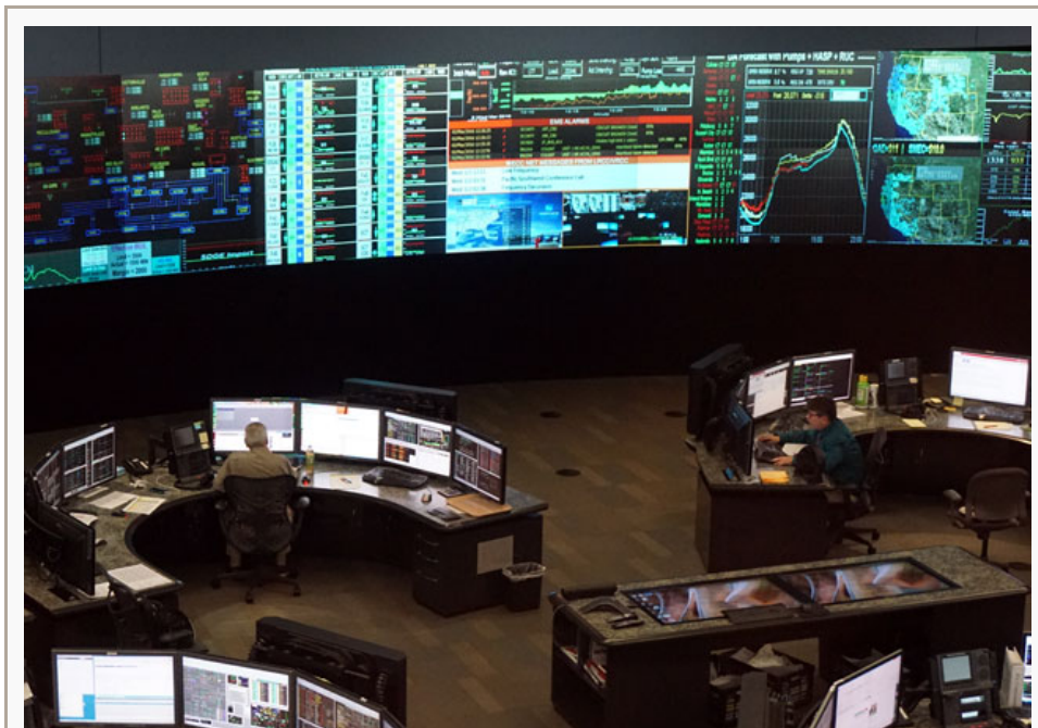
Grid operators balance California's transmission system on a minute-by-minute basis at the Independent System Operator.

PIRA ran an analysis of the Western electric grid and found that while the use of natural gas is currently declining in Northern California, it could rise around 34 percent from 2023 to 2026 because of Diablo's closure.