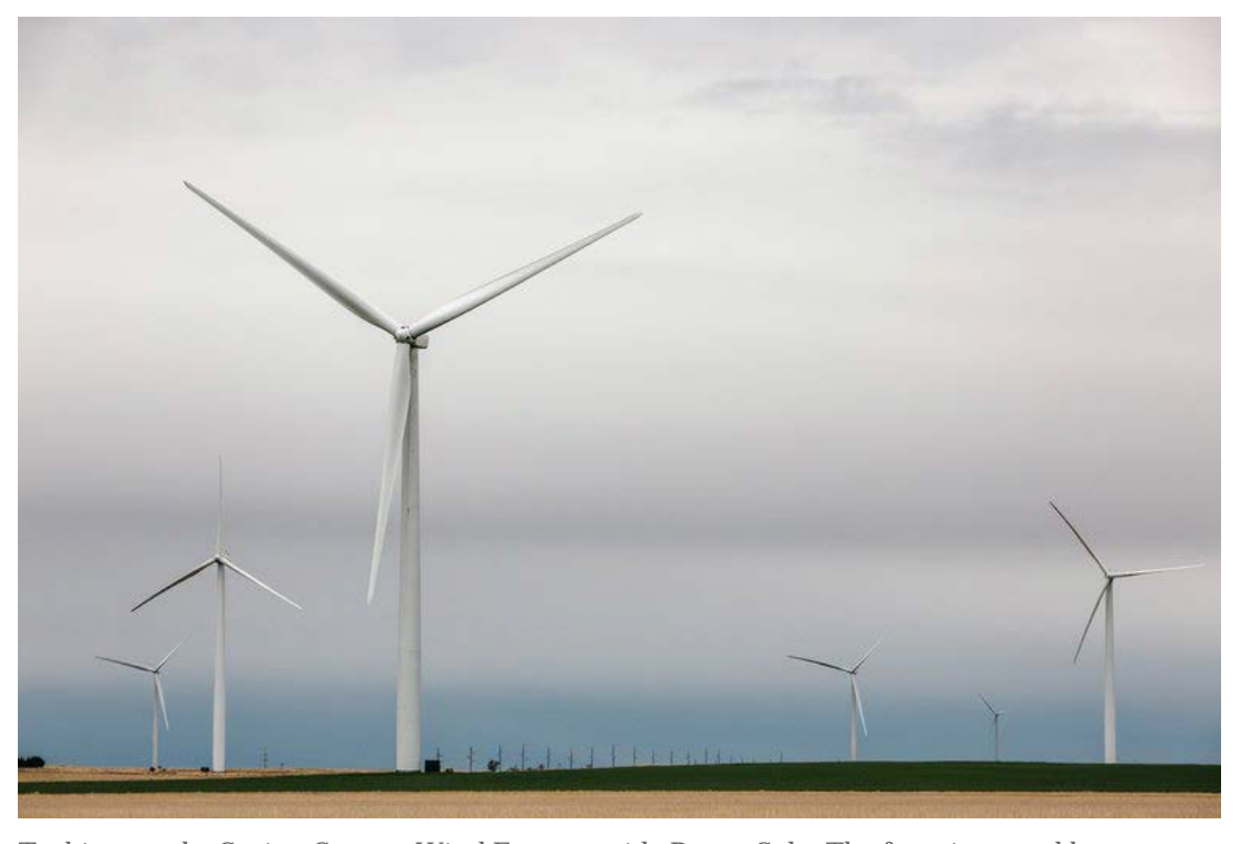
Turbines at the Spring Canyon Wind Farm outside Peetz, Colo. The farm is owned by Invenergy, and produces energy under contract to Xcel Energy.

DENVER — Imagine planning your next trip and finding that Delta was selling first-class seats for less than the cramped middle seats in the back of the plane.