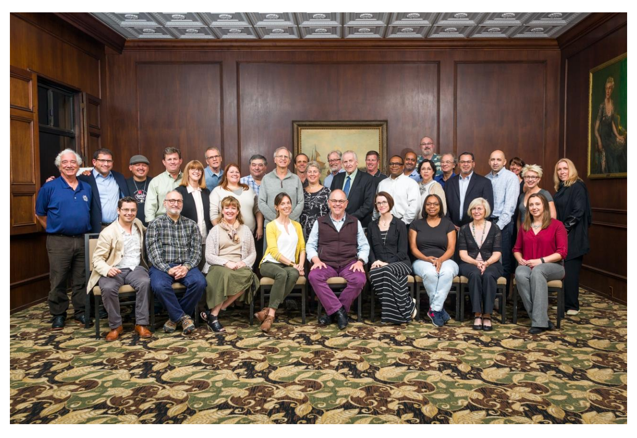
CEERT board members, staff members, and affiliate representatives