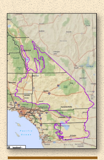
The Southern California desert encompasses 22 million acres

Solar and wind energy farm in Southern California